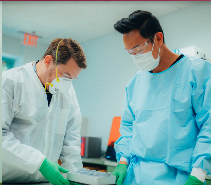
Committed to Community.